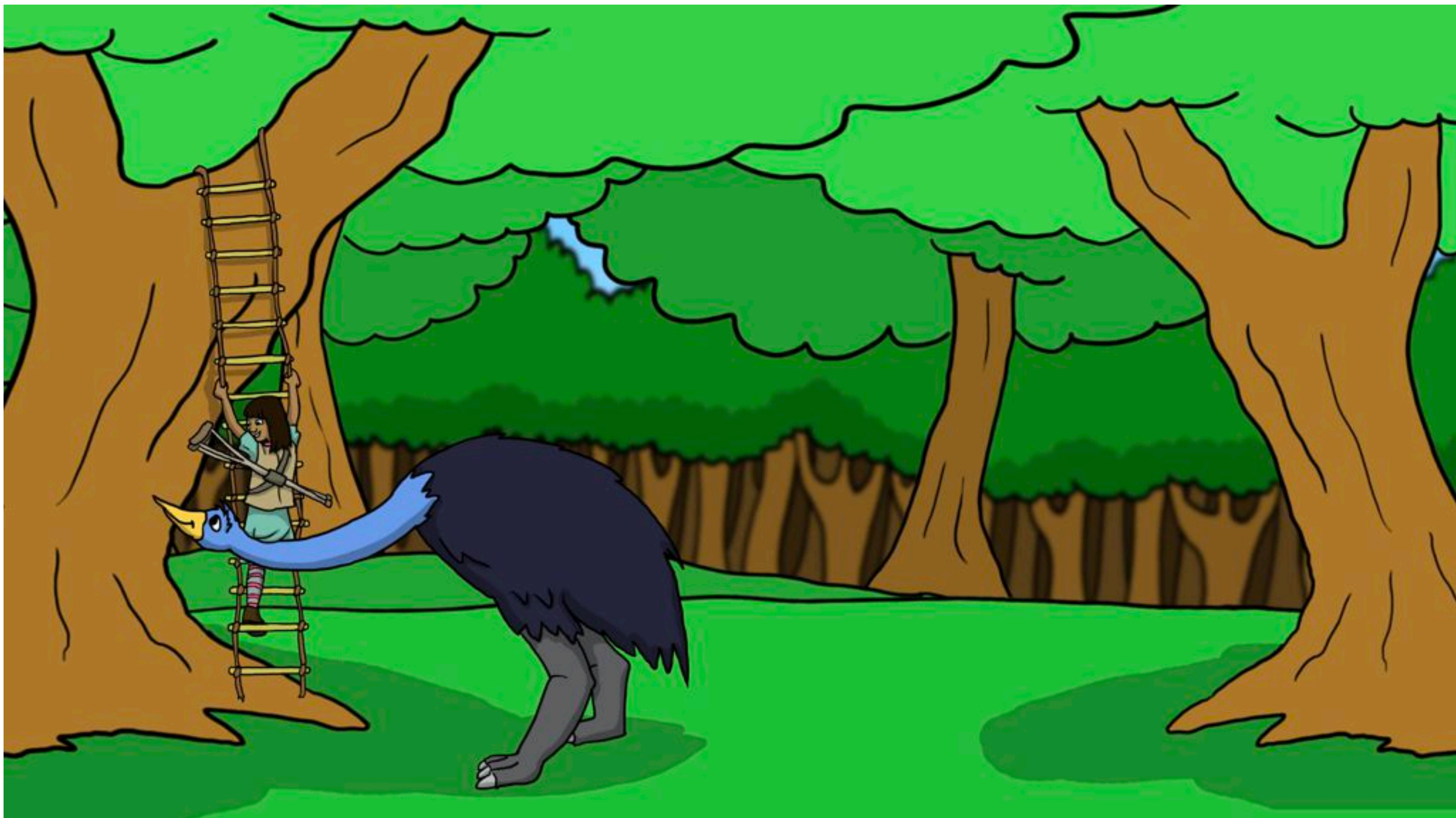
Sarita can climb a ladder.