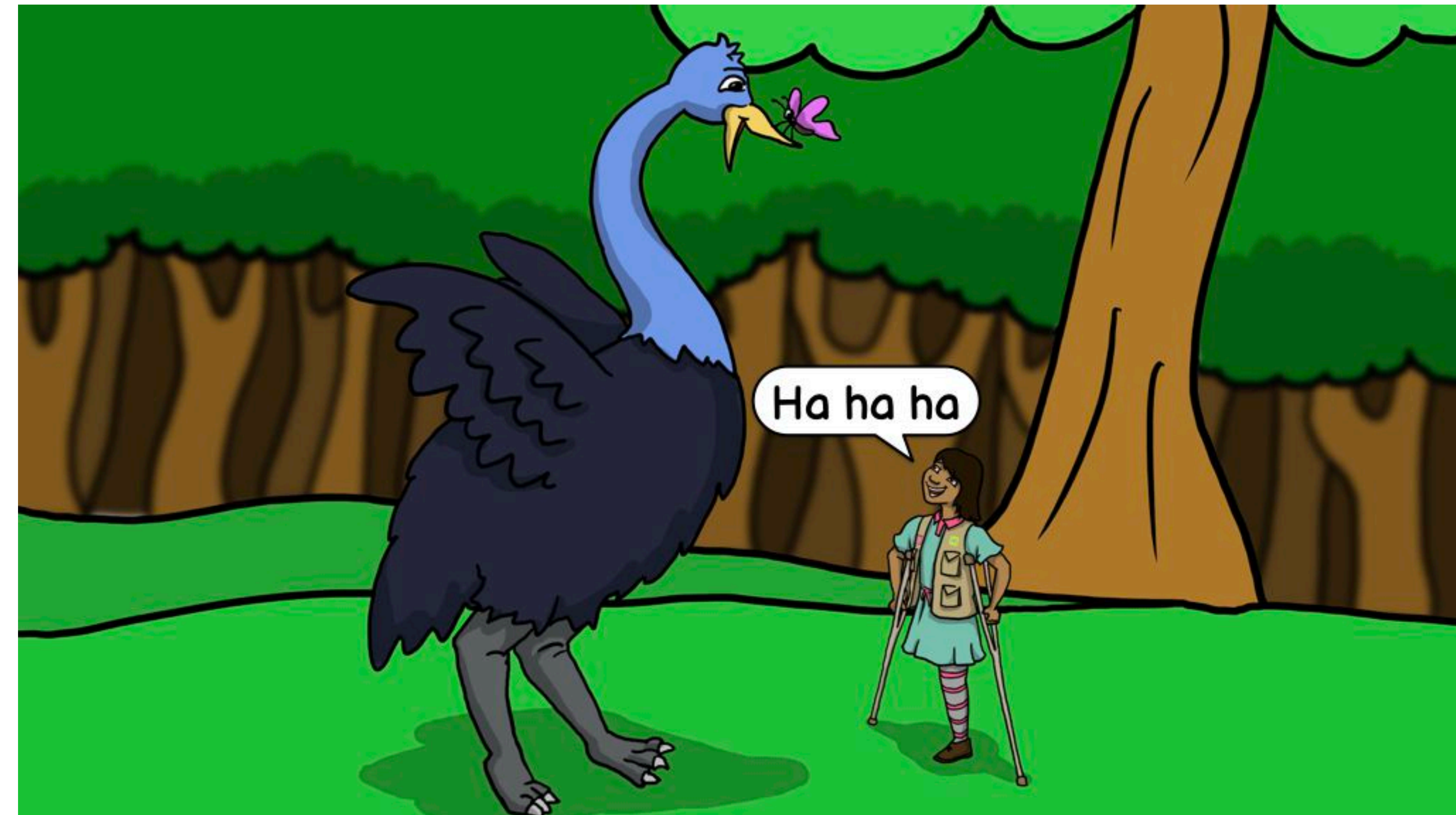
Sarita can laugh.