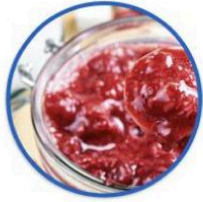
jam / jar