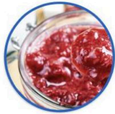
jam / jar